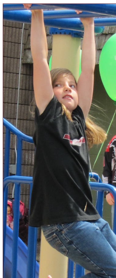
New playground at Prince Philip School has Hall of Fame connection