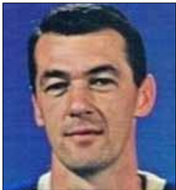
Ed Litzenberger Hockey

The late Ed Litzenberger was enshrined in the Saskatchewan Hockey Hall of Fame in July in North Battleford. Litzenberger, a native of Neudorf, was named the NHL rookie of the year in 1954-55. He was a right-winger in the NHL for 12 years, winning the Stanley Cup four times. Litzenberger played junior hockey for the Regina Pats and was with the University of Saskatchewan Huskies for three games. Also inducted in the Saskatchewan Hockey Hall this year is Bob Bourne. Bourne, a native of Netherhill, played centre in the NHL for 14 years. He won the Stanley Cup four times. He received the NHL's Bill Masterton Trophy for perseverance and dedication to hockey. Bourne was with the Saskatoon Blades for three seasons, from 1971 to 1974.